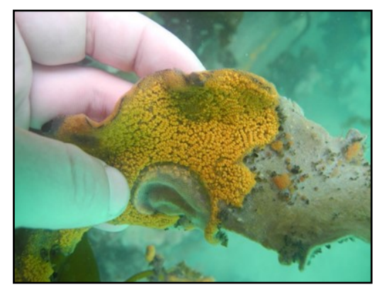
Above Violet tunicate (orange) growing on kelp in Codroy harbour. Violet tunicate can be seen competing for space with the invasive coffin box bryozoan.