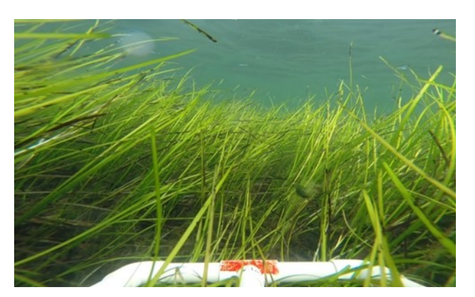
Above An eelgrass meadow in St. Paul's, Northern Peninsula. Eelgrass is a perennial flowering plant found along protected and moderately exposed sandy shorelines.

invertebrates, and shore birds rely directly and/or indirectly on the ecosystems services provided by eelgrass meadows in shallow, subtidal environments (Orth et al. , 2006; Barbier et al. , 2011). The recent introduction and future range expansion of invasive tunicates in western NL will put additional pressure on eelgrass habitat, which may lead to large scale changes in the composition and structure of subtidal coastal communities. Qalipu Natural Resources is currently working on a multiyear research program to determine factors influencing the population dynamics and documenting the effects of these invaders in our coastal environments.