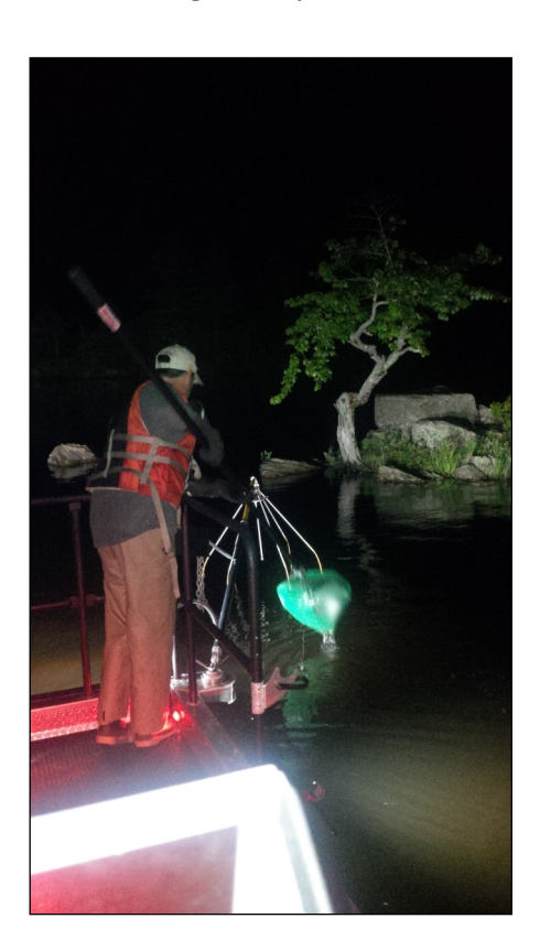
Above Electrofishing at night on Hebb Lake, Lunenburg County.

1) A collaborative initiative between the Department of Fisheries and Oceans Canada and the Provinces, through the National Aquatic Invasive Species Committee (NAISC), was able to facilitate the implementation of the Aquatic Invasive Species Regulations , a suite of regulatory tools that