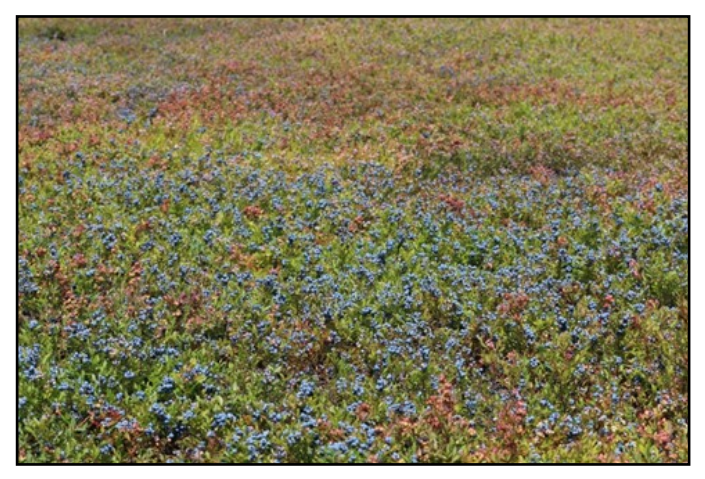
Above An irresistible blueberry buffet Below Whimbrel in a Brantville NB blueberry field