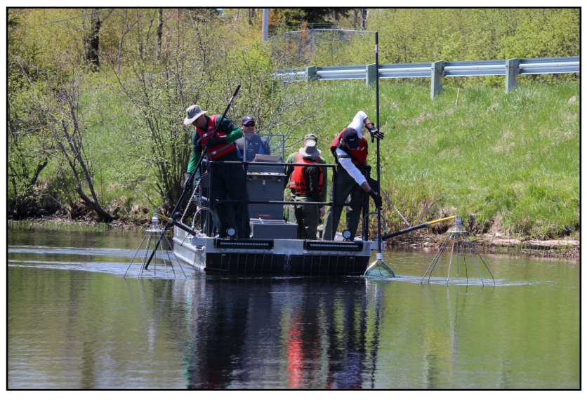
Above Staff training exercises on an electrofishing boat.

can be used to prevent new introductions and manage the spread of AIS. These regulations will initially focus on high-risk species and geographic areas. They also provide tools to provincial/ territorial governments to act to address AIS in jurisdictions where they manage the fishery. The AIS Regulations and Regulatory Impact Analysis Statement can be found in the Canada Gazette, Vol. 149, No. 12, Part 2, at www.gazette.gc.ca.