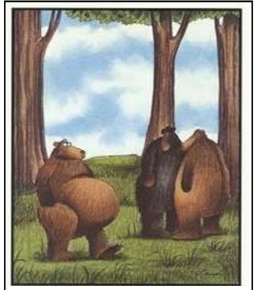
Impolite as it was, the other bears couldn't help but stare at Larry's enormous deer gut.