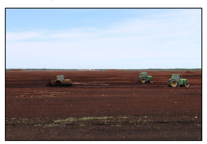
Above Peat mining on the Acadian Peninsula.

However the landscape of the Acadian Peninsula has changed significantly since John McSwain made his observations. Many of the large coastal bogs where extended patches of crowberry and blueberry grew have been heavily disturbed by peat mining activities, one of the most important industries in the region. Parallel to this, over the past 20 years, the blueberry industry has grown significantly in New Brunswick. In 2012, there were 220 growers tending 33,000 acres and in 2013, the province produced a 5-year strategic plan that called for the development of at least another 20,000 acres of blueberries, and this primarily on the Acadian Peninsula (NBWBSS, 2013–2018).